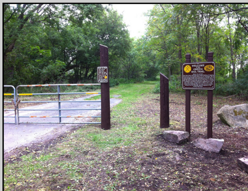
Oneida Rail Trail