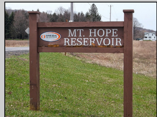
Mount Hope Reservoir