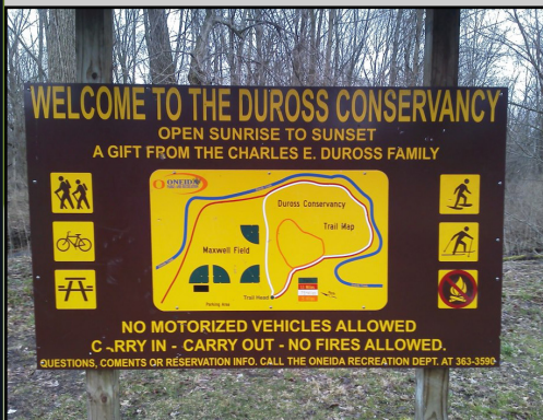
Duross Nature Conservancy